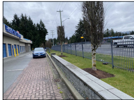
BIKE RACKS: SEE DETAIL